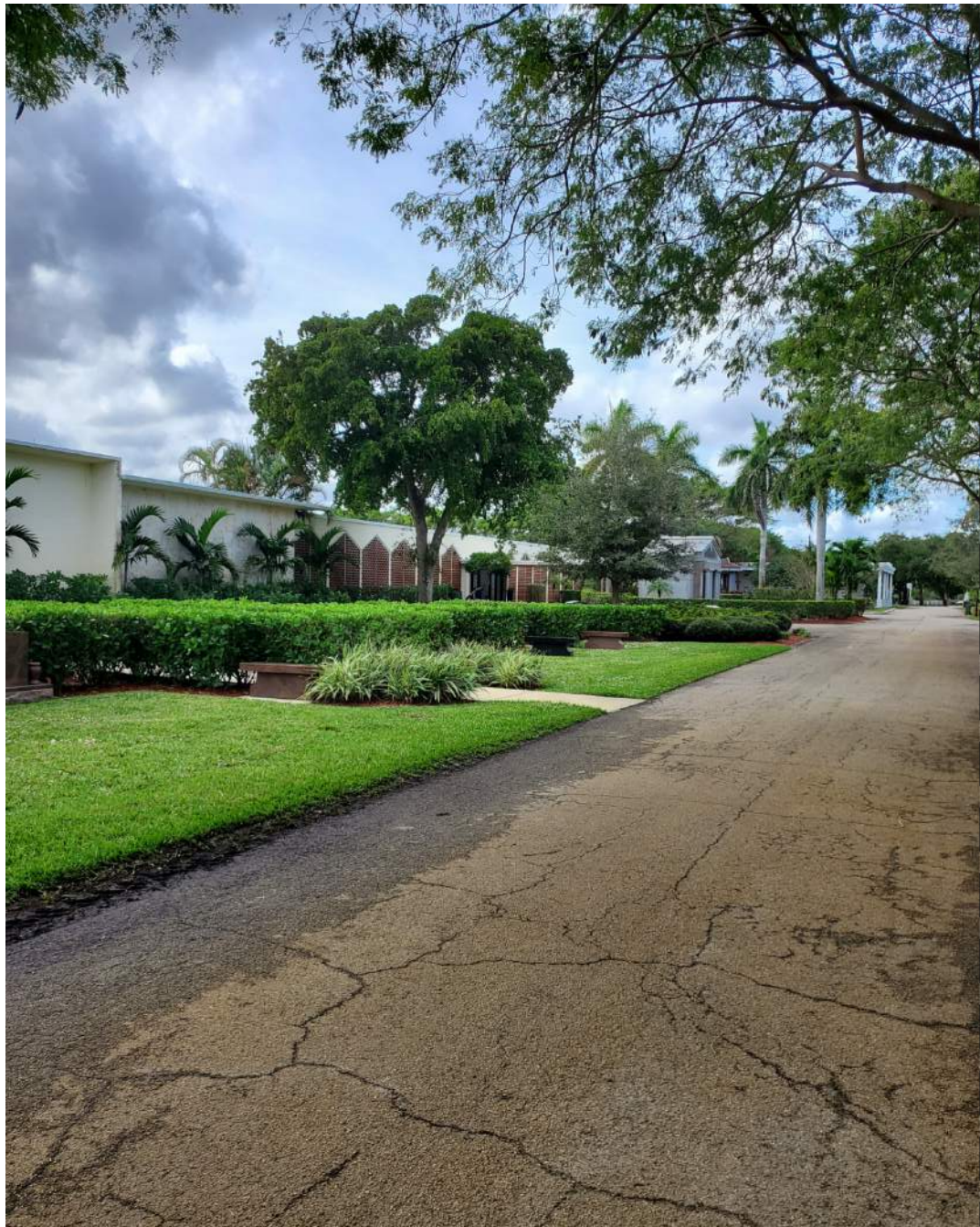
VIEW - H