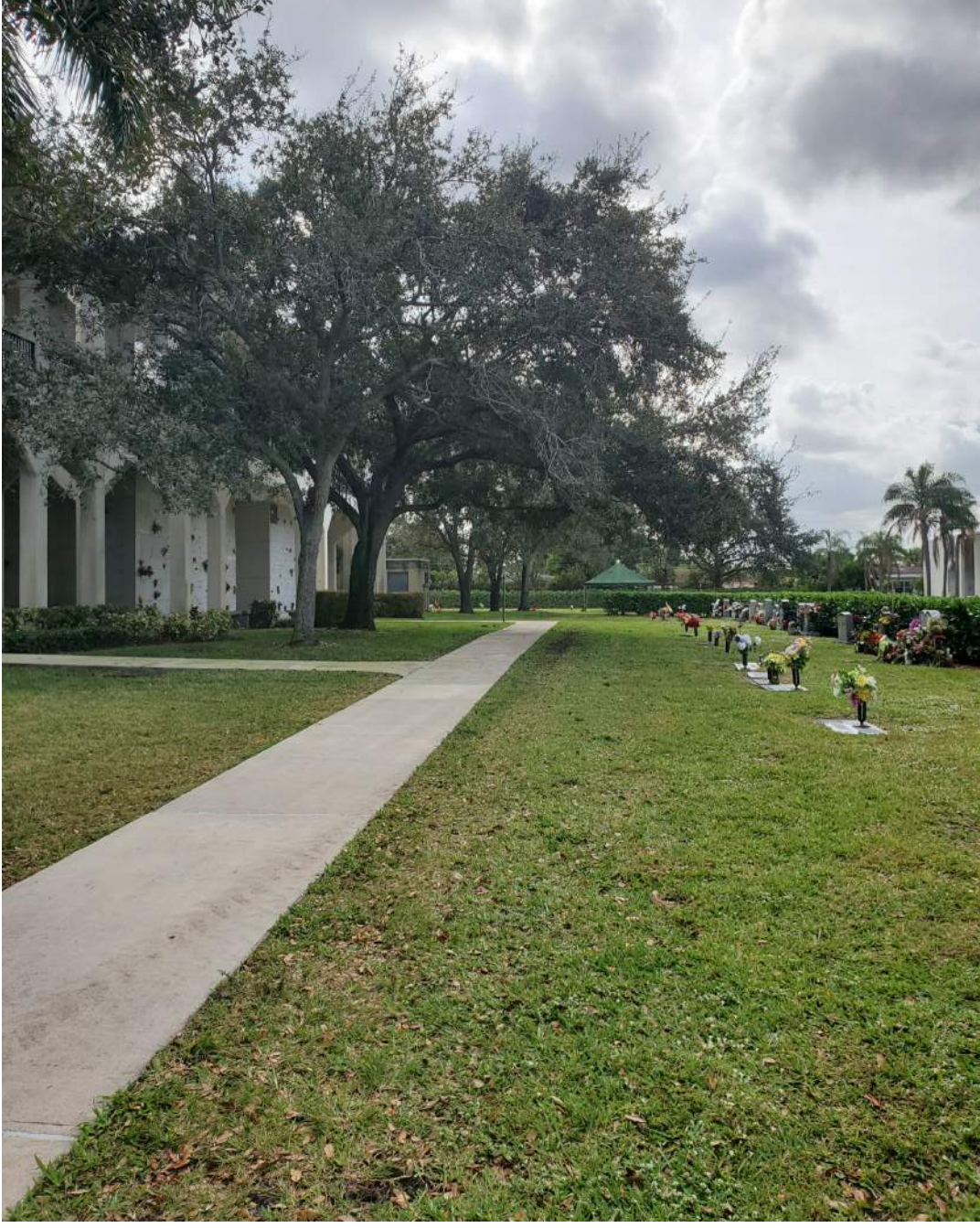
VIEW - I