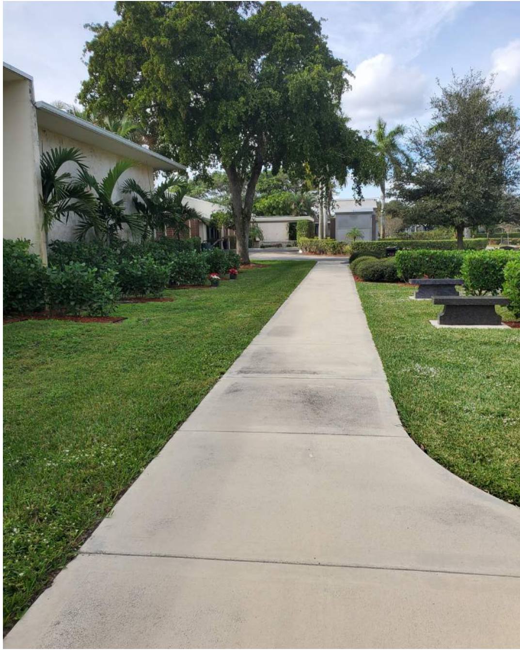
VIEW - E