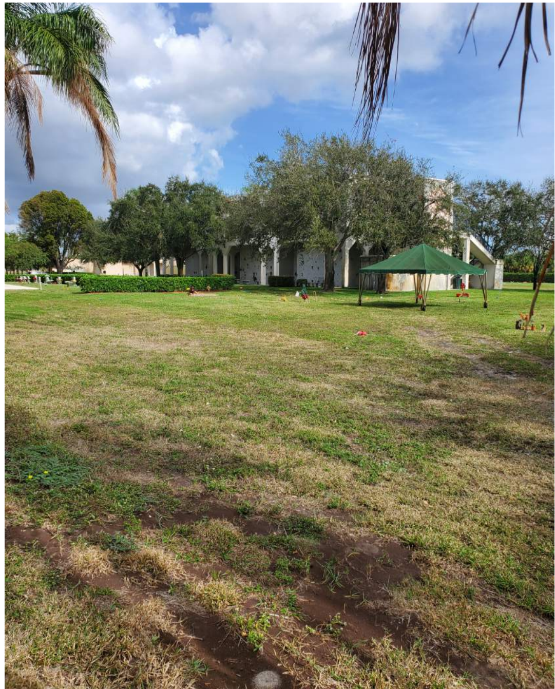
VIEW - D