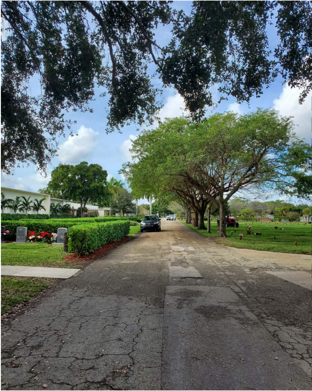
VIEW - G