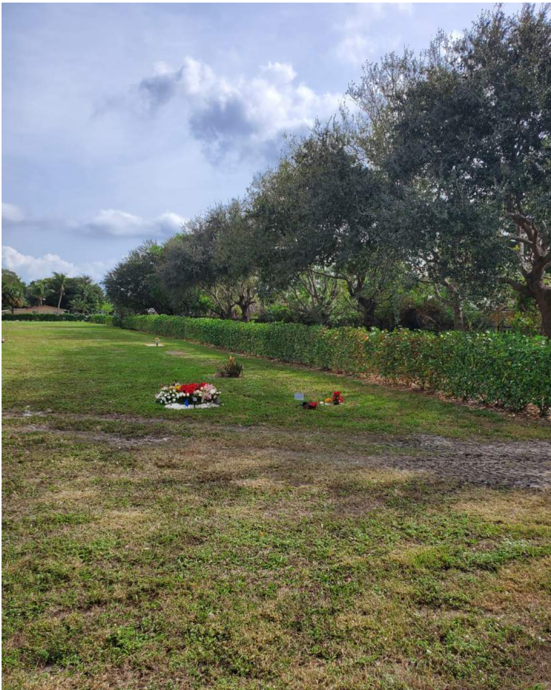
VIEW - C