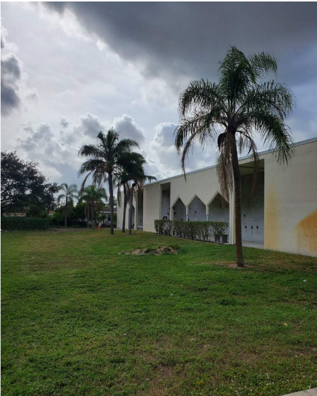
VIEW - B