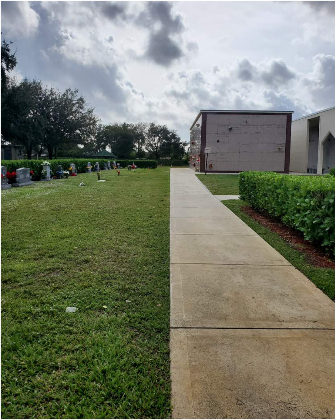
VIEW - F